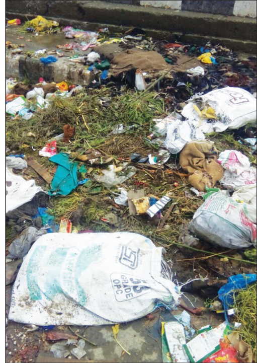
Bus stand Udhampur

The waste was being transported in open/ uncovered vehicles as the ULBs were neither equipped with such facilities nor possessing tarpaulin sheets/ poly sheets to cover garbage carrying vehicles.