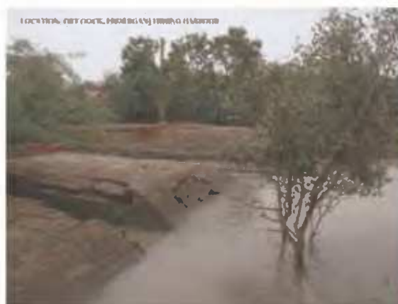
Figure : Dilapidated dry dock at Frazerganj

Thus, in absence of regular maintenance and upkeep, various facilities created in the harbours were not utilised optimally to cater to the need of the fishermen. The Department accepted (December 2015) the audit findings.