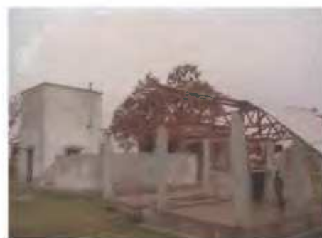
Damaged fish hatchery at Joypur

₹ 42.18 lakh. Scrutiny of records related to two test checked hatcheries—one at Government Fish Technological Station (GFTS), Junput and another at Joypur Fish Farm, Purulia revealed that though expenditure of ₹ 24.13 lakh had been