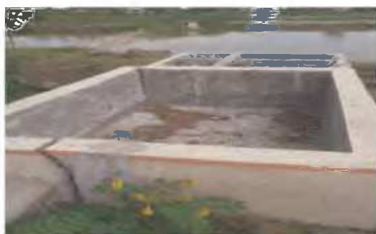
Damaged Hatchery at Junput

The Department took (2010-11) the work of construction of three 34 new hatcheries for endangered fish species under RKVY at an estimated cost of