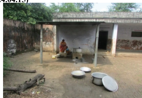
Open Kitchen Shed at MS Bokaro Sector-4 September 2014