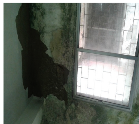
Dilapidated condition of building of RHTC, Govindpur

The RHTC and UHTC both of PMCH Dhanbad for imparting practical training on community oriented primary health care were defunct for want of man power as well as infrastructure.