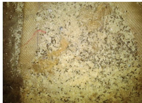
Rotten food grains with defecation of rat at primary school Loyabad, Dhanbad-II dated (24.04.15)