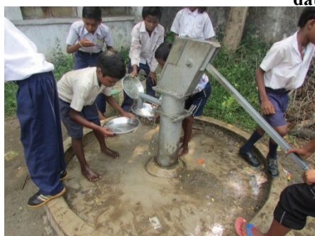
Children washing their plates after eating MDM at MS Bokaro Sector-4