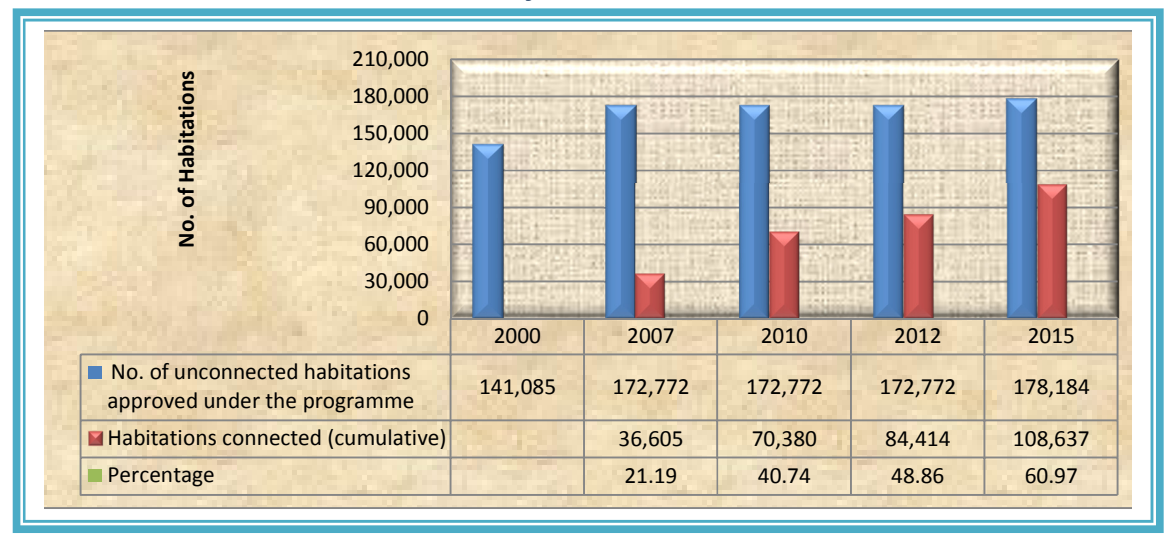
Chart -1.3 Physical Achievements