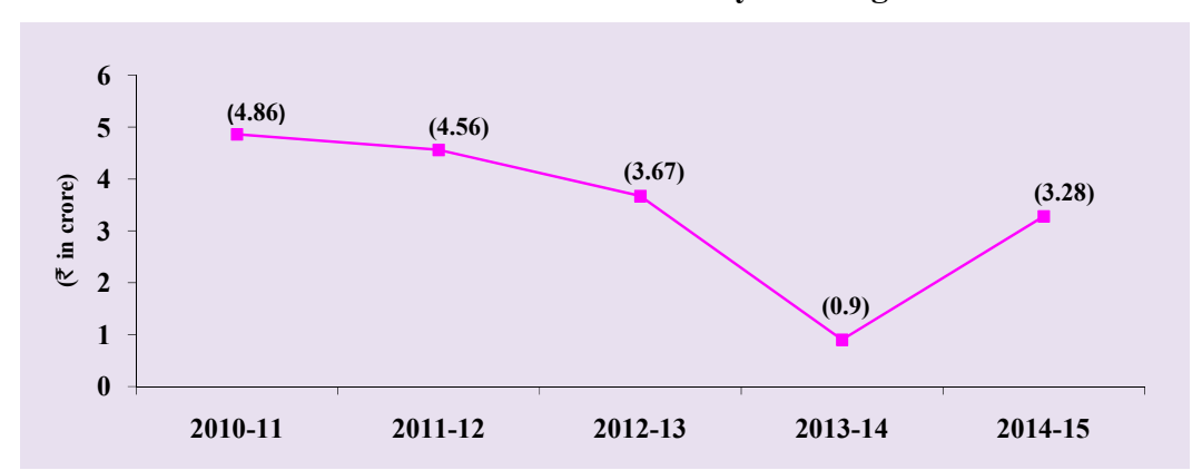
Chart-5.4: Overall loss incurred by working SPSUs

5.14 Overall losses incurred by State working SPSUs during 2010-11 to 2014-15 are given below in the chart.