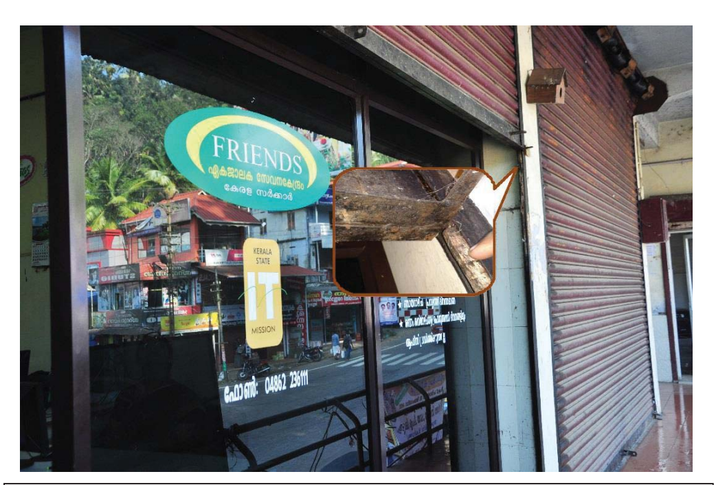
Picture depicts view of Idukki Centre, where the steel shutter cannot be closed. The shutter channel is blocked with wooden logs to prevent collapsing of the damaged steel shutter. Inset picture displays a wooden log used as blockade.

• The Centre deviated from the established procedure of remitting the daily collection in the bank. Even when a single day's collection was as high as ₹9.55 lakh during the period, the bank did not send their staff to collect the cash. Since the cash could not be kept in the Centre due to safety reasons, the staff members were compelled to carry the cash home and bring it back on the next day.