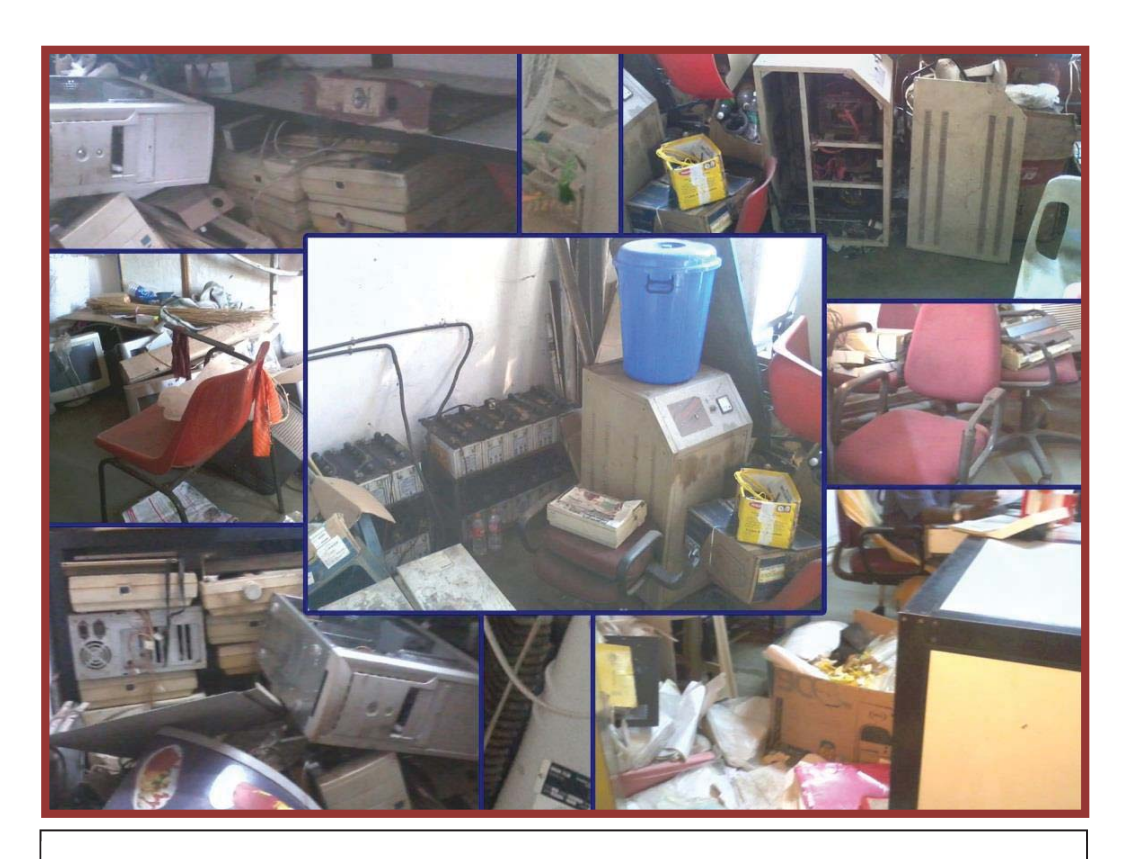
Picture shows dumping of scrap over the UPS, battery and near the counters in Thiruvananthapuram and Malappuram Centres.

The Government stated (November 2014) that the scrap had since been disposed of from Centres in Thiruvananthapuram, Kollam, Pathanamthitta, Malappuram, Kannur and Kottayam and instructions had been issued to other Centres for disposal.