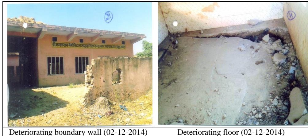
Community Centre building at Nagar Panchayat , Oon, Shamli

On this being pointed out (December 2014 and June 2015), EO, Shamli accepted that the building was lying unutilised and stated that the work was stopped due to non-release of funds by the State Government. The reply is not acceptable as the funds released by the Government under SVY had already been utilised to the extent of ₹ 12.02 lakh i.e. in excess to the sanctioned amount of ₹ 7.06 lakh for the Community Centre. However, NP did not release funds from its own resources, as required under the sanction issued by GoUP which resulted in non-completion of community centre as of September 2015.