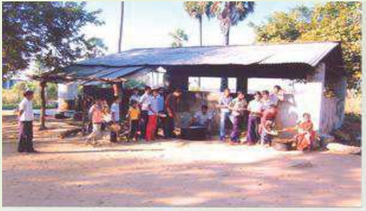
Open drainage in Integrated Hostel Welfare Complex Nandyal, Kurnool district