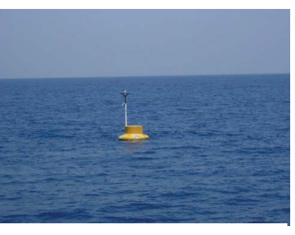
Data buoy in sea

The project envisaged deployment of 12 data buoys<sup>34</sup> in ocean over three years for collection of time-series data on various meteorological and oceanographic parameters in the EEZ<sup>35</sup> waters of India. Buoys were to be equipped with sensors for measurement of parameters viz. wind, wave, current, atmospheric pressure and temperature, sea surface temperature,