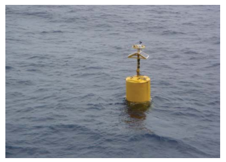
Spar type low cost buoy

NIOT made two attempts till December 2007 to design and fabricate the buoys but failed as one buoy was damaged during deployment and another buoy worked only for a week. NIOT decided (January 2008) to make another attempt with a new design and to deploy 25 such buoys by June 2008. However, NIOT developed only two buoys with the new