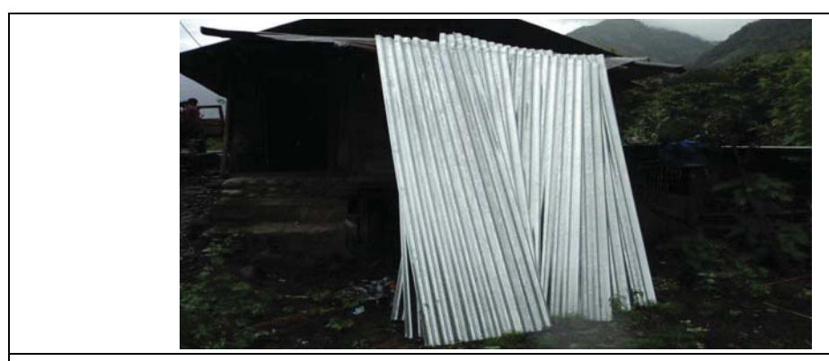
CGI sheets not utilised for construction.