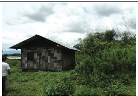
Isolated Houses without amenities like roads, drainage etc.