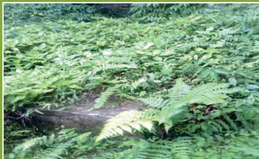
Dried source of Lower Tokal MIC at Bermiok