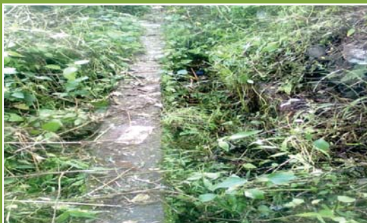
Guay Khola MIC, needs maintenance and repair