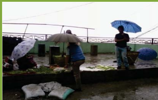
Rural people selling their products on the road side