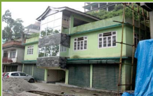
Idle Rural marketing outlet at Ghurpisy