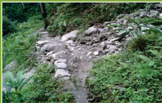
Damaged MIC at Kabirthang

The Department (October 2012) stated that the work was shifted with the approval as demanded by the Panchayat of Yangtey GPU and it catered to several families. The reply was not acceptable as during physical verification, it was noticed that the MIC was not even connected with any agricultural farm and catered to only one family in the new site.