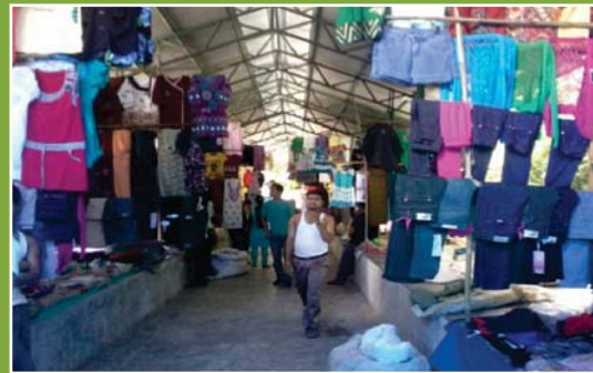
Selling of readymade garments at Haat shed at Sombaria

The UDHD stated (November 2012) that the Joint Secretary (South/West) had been directed to ensure proper utilisation of the assets.