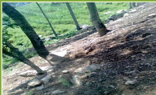
Dong Khola to Simbalbotey MIC