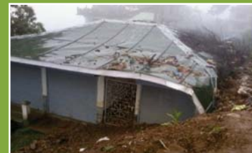
Three Pay & Use Toilets-cum-Shops lying idle in dilapidated conditions

Though the reasons for idling of these assets were not recorded, physical verification revealed that these assets were created in isolated areas hardly visited by people. The Department had thus, created the infrastructure without any plan and without giving thought to the suitability of their location for use by the public thereby rendering the assets created from the borrowed funds unusable. Also, the public were denied the use of much needed facilities.