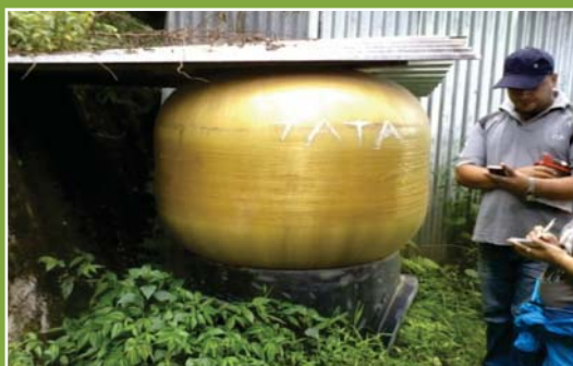
Idle pressure filter at Darap water supply scheme