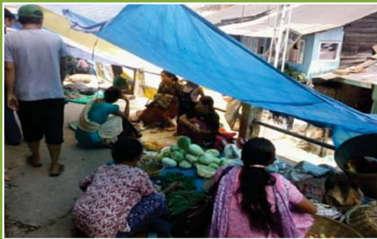
Traders from rural areas selling their products in open space at Sombaria Bazaar