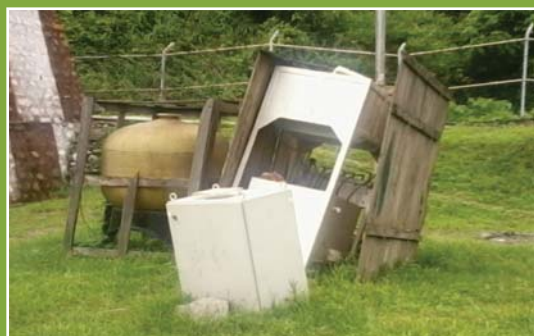
Idle pressure filters and electro chlorinator of Reshi water supply scheme