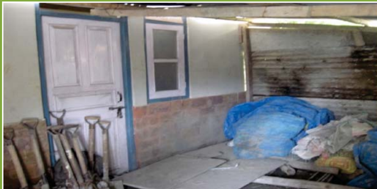
Main entrance of the Pay & Use Toilets-cum-Shops blocked by a godown

Other three PUTSs at (i) Cho Dzo, Rabongla, (ii) Pelling Road, Gyalzing and (iii) City centre at Namchi constructed (March 2009) at a cost of ₹ 67.82 lakh were also lying idle in dilapidated conditions as shown in the photographs.