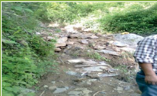
Dried source of Pharasey MIC at Salghari