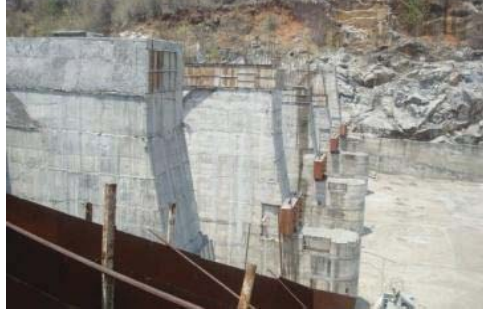
Incomplete Head Works

stipulated for completion in three years (March 2007). The project was incomplete due to modifications in the designs of the spillway and change of alignment of canal/design of structures during execution and non-acquisition of land for the distribution system, with expenditure (March 2012) of ₹48.81 crore unfruitful. Further, revised sanction