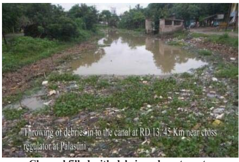
Channel filled with debris and waste water

Before commencement of work 7.800 km (Palasuni to Garage Chhak) was transferred (September 2010) to Works Department for renovation and development of a four lane road involving ₹28.71 crore. Only, 813 metre of the canal was improved (March 2012) expenditure of ₹ 1.38 crore (Out of