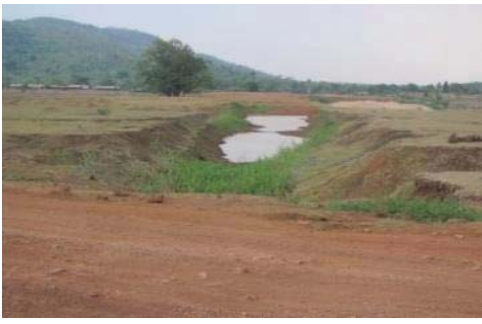
Incomplete Head Works

We noticed that the Ministry of Environment and Forest (MoEF) suggested (November 1990) that rehabilitation plan of project affected families of 21 villages be concurrently implemented and completed before six months of the target date for impounding the reservoir. However, 469 families of six villages only were rehabilitated. Subsequently, Odisha University of Agriculture and Technology, Bhubaneswar conducted economic and cultural survey of the affected villages and assessed (2006) that 1220 families were eligible for the R&R assistance. The rehabilitation issue was not solved and the sanction under tranche X lapsed in March 2010. The project