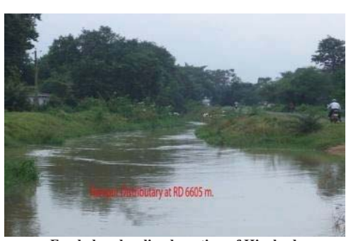
Eroded and unlined portion of Hirakud Distribution System not covered under RIDF