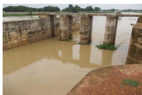
Incomplete Head Works

We noticed that the project was taken up in split up manner. Head works were completed in November 2009, left and right main canals were abandoned mid way (August 2010/January 2011) by the contractors and another reach of main canal was execution. The project remained incomplete with expenditure ₹ 9.13 crore (July 2012). The