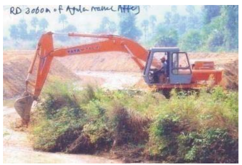
Agula Nallah excavation by excavator

drainage channels in the DPRs (estimates) at rates between ₹ 35.80 and ₹ 68.41 per cum. The works with the inflated costs (excavation by manual means) were put to tender. However, as per the notice inviting tenders, availability of machinery (excavator) required for execution of the work was one of the criteria to qualify for the tender. The works were executed during 2008-12