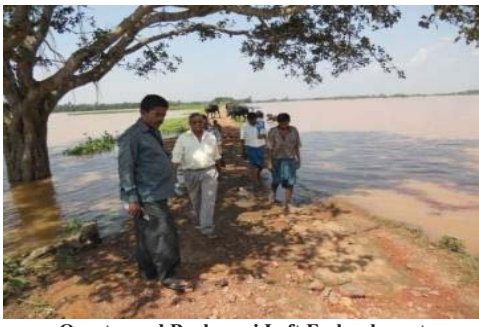
Overtopped Brahmani Left Embankment

We noticed that due to non-raising of the embankment up to a required height including necessary free board together with non selection and inclusion of the projects of weak