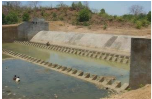
Completed Head Works of Saldihi MIP

systems were not taken up as of March 2012 due to non-acquisition land (30 projects), finalisation of the ayacut planning of the distribution system (15 projects), delay in finalisation of tender (3 projects) and delay in award of work projects) resulting (3 investment ₹ 50.04 crore not yielding any results.