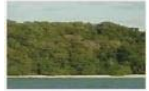
Verv Dense Forest

of Forest Report 2011 published by the Forest Survey of India (FSI). Though it was more than the percentage laid out in the National Forest policy, there was decrease in Very Dense Forest (VDF) by 13 sq km and Moderately Dense Forest (MDF) by 28 sq km with increase only in Open Forest (OF) by 89 sq km as per FSI report of 2009 and