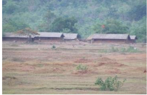
Non evacuation of PAPs from Dam base

was not completed despite an expenditure of ₹ 113.04 crore (April 2012) and no tender for execution of head works was in force (April 2012). The head works was partially completed as shown in the photographs.