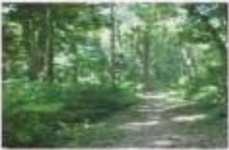
Moderately Dense Forest