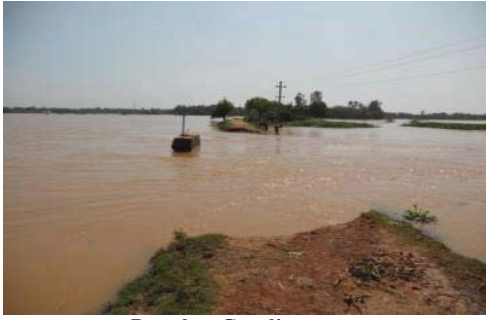
Breach at Gopaljewpatna