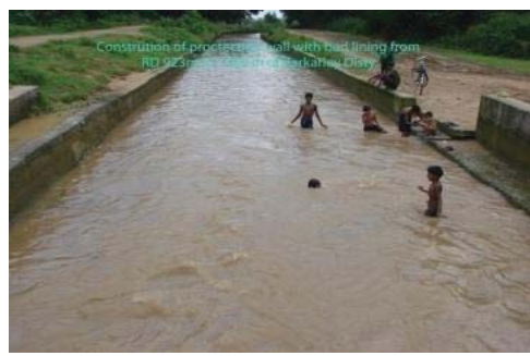
Renovated portion of Hirakud Distribution System

We noticed that the approved plan was deviated during execution. Drainage siphons (25 numbers) and village road bridges (23 numbers) approved for construction were not executed and of the 13.385 km, the Department improved 6.255 km leaving 7.130 km unexecuted and covered other unapproved portion for 17.702 km. In execution of protection wall, of the 15.163 km approved, 9.022 km was executed leaving 6.141 km unexecuted and unapproved portion of 27.488 km was executed. The works were executed in disintegrated manner in patches. The photographs indicate lack of continuous improvement to the canal.