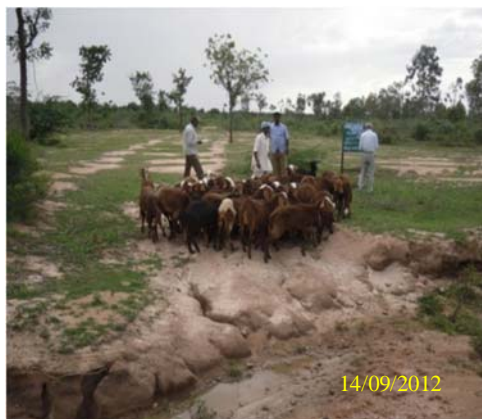
Grazing at Kuduremothi plantation at the time of inspection

Physical verification (September 2012) of plantations raised at Kuduremothi in Koppal range during 2008-09 revealed that in 25 ha of land with various species like Honge, Neelagiri, Karijali was partially destroyed due to grazing by livestock and failed plantations as shown in the photographs: