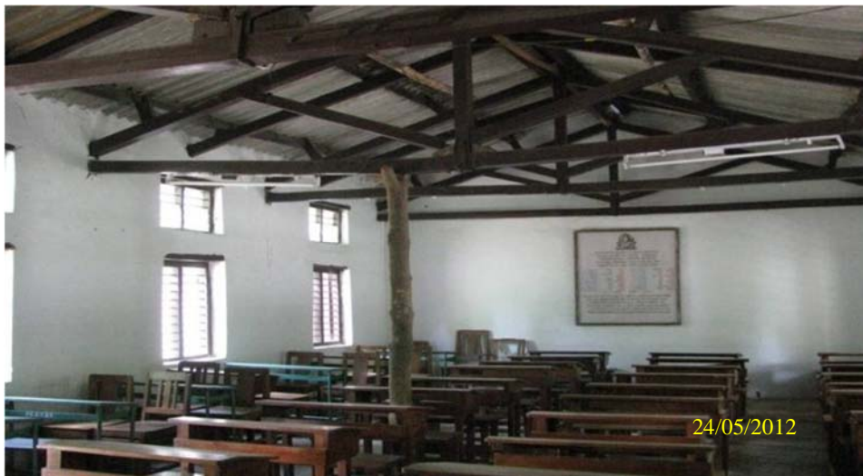
Photo of class room of training centre at Thattihalla

The Government accepted (November 2012) the audit suggestion that refresher courses for frontline staff would be conducted in future and IT facilities would be provided by procuring 90 computers. Further, it was intimated that ₹ 1.50 crore had been recently allocated for modernization of the training institute and ₹ 53 lakh for class room.