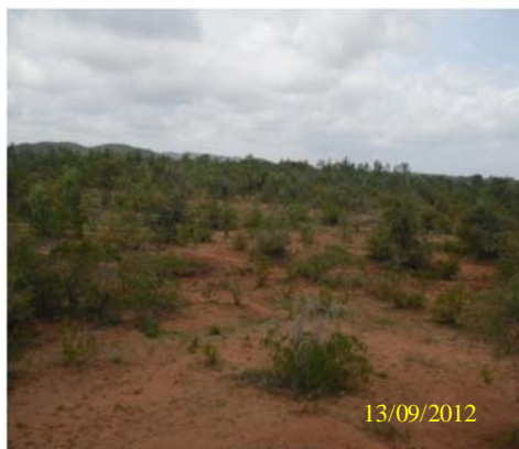
Plantation at Varavi

The status of plantations raised at Varavi and at Majjur both coming under Shirahatti range of Gadag Division during the physical inspection (September 2012) was as under: