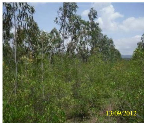
Planatation at Majjur

Despite comparable climatic conditions, plantations (comprising species such as Nilagiri, Bevu, Hulgal, Hunase) at Varavi raised during 2006-07 showed stunted growth while the plantation at Majjur appeared dense and healthy inspite of the fact that the plantation was one year older than Majjur. Physical verification also revealed partial destruction of plantations at Varavi due to heavy cattle grazing, hacking/ illegal cutting of trees affecting growth. In the absence of protection measures the afforestation works taken up failed to render the desired output.