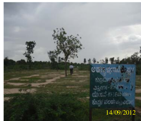
Failed plantation at Kuduremothi