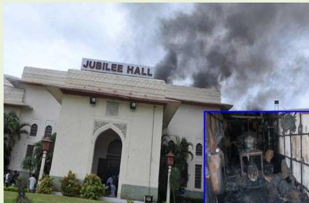
Fire incident at Jubilee Hall (Inset: burnt AC plant)

It is pertinent to mention that there was a fire accident on 1 July 2012 in the Jubilee Hall 15 minutes after conclusion of an important meeting which was attended by high dignitaries.