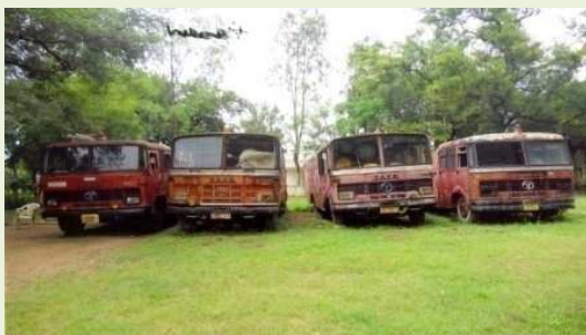
Tandur FS-Fire tenders parked in the open (17 September 2011)

Out of 253 fire stations in the State, 30 fire stations were functioning without buildings. In the seven sampled districts, 17 out of the 85 fire stations (20 per cent) were in a dilapidated condition and in another six fire stations, there was no shelter for fire tenders as can be seen below.