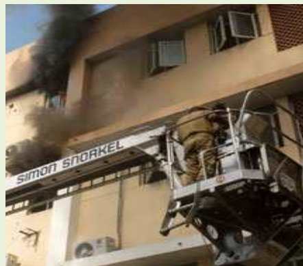
Fire incident in 'D' block of AP Secretariat

DGFS replied (November 2012) that Multi Storied Building Inspection Committee (MSBIC) 26 made certain recommendations for fire precautionary measures to be adopted in each block in the AP Secretariat and instructions in this regard would be issued to the concerned to ensure fire and life safety.