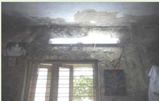
Parigi FS rest room (17 September 2011)