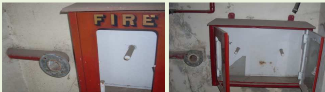
Defunct Hydrant system in Gagan Vihar (12 July 2012)

DGFS replied (November 2012) that the Gagan Vihar MSB was inspected (September 2012) by the Department and several deficiencies were noticed in fire safety measures. He further stated that the Vice-Chairman and Commissioner, AP Housing Board was requested to provide fire safety measures and to ensure compliance of required fire precautionary measures.