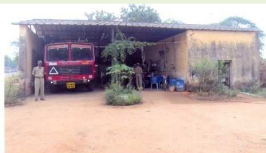
Gadwal-FS building in a dilapidated state (10 November 2011)