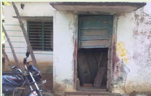
Narsipatnam FS toilet (4 January 2012)

DGFS replied (November 2012) that this problem would be addressed soon since funds were allotted by the Government during the year 2012-13 for construction of fire station buildings with rest rooms and toilets.