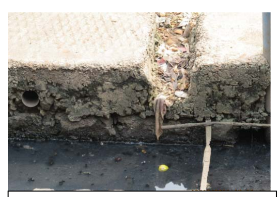
Discharge of waste water from Kharagpur Station (SER)

In SECR, petroleum products were found deposited alongside the track. These were deposited during unloading at the POL Siding at Bhilai. Oil spillages were also noticed during loading activities at GR siding, Bajwa (WR). It was noticed that there were no specific instructions from the RB regarding treatment of oil spillages at sidings. In WR, it was observed that the spilled oil along with other wastes was being treated through the effluent treatment plant.