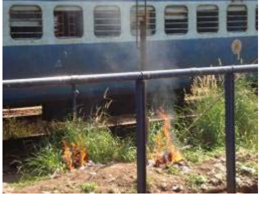
Unscientific Landfill at Tatanagar (A1) Railway station, SER