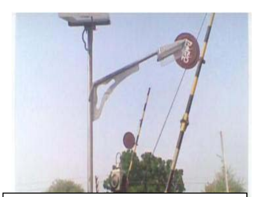
Solar Panel at manned level crossing between Darazpur - Mustafabad section, NR