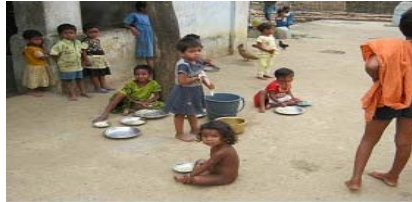
Children taking spot feeding on village road in Karanjakata II AWC

in Karanjakata-II AWC under Harabhanga AWC Badabandha II depending on ICDS project that the children were served village Nallah for drinking water cooked food on the village road and in Badabandha-II AWC, the water from the nearby “nallah” was used for cooking and drinking purposes.