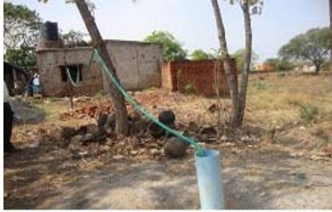
Borewell of Gokulananda Sahoo used for liquor factory

During joint physical inspection and interview with the farmers provided with bore wells and dug wells etc., it was seen that out of eight cases, five 58 farmers were using dug wells for growing vegetables, but they were not cultivating “rabi” crops due to shortage of water. Bore wells in two cases 59 were not used at all due to lack of electricity and defects in pump sets. In one case 60 , the bore well was used for supply of water to a country liquor factory. As a result, the very basic purpose of providing