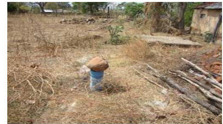
Borewell of Kaushalya Sahoo not functioning