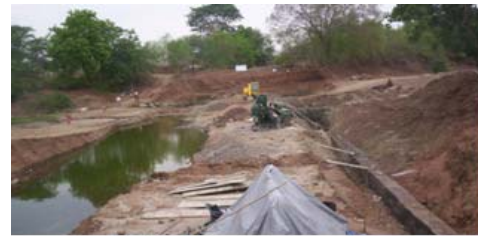
T-6 to Shyamasundarpur road not in use for missing link

PMGSY, the intervening bridge having span length more than 25 meter was to be so planned that the bridges were constructed simultaneously by the State government to provide connectivity to the targeted habitation.