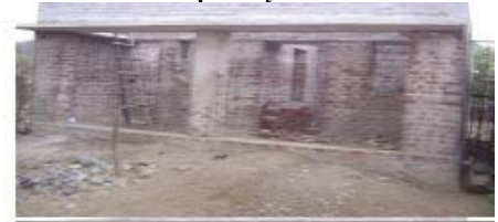
Bigger house left incomplete by Gananai Pradhan of Pindapadar of Kantamal Block