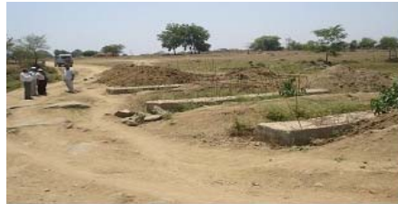
Photograph of incomplete bridge in Amarda village road

Test check of records in three blocks showed that 325 works taken up during 2007-10 at an estimated cost of ₹ 7.74 crore were not completed despite incurring an expenditure of ₹3.86 crore as of March 2012 as detailed below: