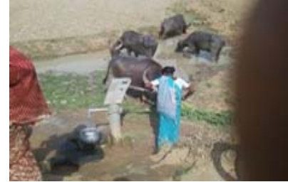
Tube Well in village Kantha

Test check of records disclosed that, out of the 5027 spot sources (TWs-4893, SWs-134) existing in the district, only 3123 were covered under water quality test (March 2012) while 1904(38 per cent ) were left without quality testing.