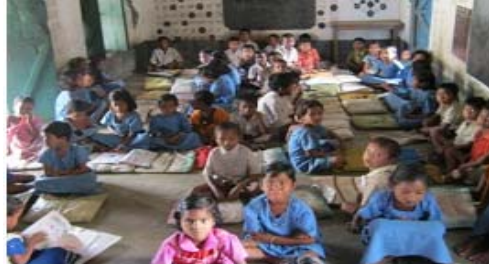
Students of four classes were sitting together in Badakusanga PUPS of Kantamal block

For creating better teaching environment in the schools, the guidelines on SSA emphasised on a room for every class or every teacher, whichever was lower.