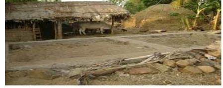
Incomplete house of Sabitri Palai of Baghiapada Gram Panchayat for her poverty

The Collector stated (September 2012) that steps are being taken to complete the IAY houses.