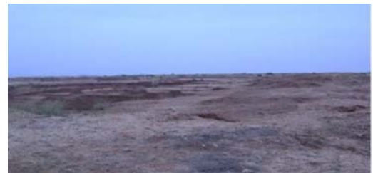
Excavation of new tank at Khambeswarpali, Kantamal Block

An amount of ₹ 15.65 crore was utilised during 2007-12 for renovating tanks under the activity of restoration of traditional water bodies. Information regarding the capacity of these tanks and actual utilization of its water for