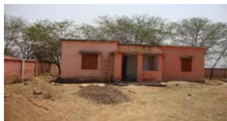
Ambajhari sub-centre located outskirts

As per instruction of NRHM directorate, new constructions were to be located in habitations as decided by the Gaon Kalyan Samitees (GKS) and not in the outskirts of villages under any circumstance. Scrutiny of records revealed that some SCs like Ambajhari in Boudh block, Lunibahal and Mohalikpada under Harabhanga Block were constructed in outskirts of villages where ANMs were not staying and buildings were left unused.