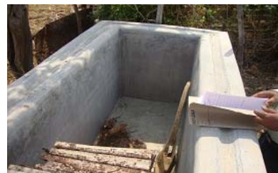
Vermi hatchery unit of Nanda Kishore Kalta without vermicell and compost