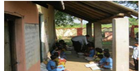
Students of Tileswar Primary School, under Harabhanga block reading in school veranda

We found that out of 908 schools functioning in the district as on 31 March 2012, 28 (three per cent) schools with 1423 students did not have class room and 111 (12 per cent) schools with 4401 students were running each with single class