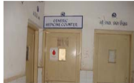
Non-functioning Jana Aushadhi Kendra

Jan Aushadhi Campaign (JAC) was launched (2010) by Government with the objective of supplying quality medicines at affordable prices to all, especially to the poor and disadvantaged groups of the society. It was seen that only one room was provided by the CDMO for JAC in the DHH but it had not started functioning as of April 2012. As a result, patients were deprived of quality medicines at affordable cost.