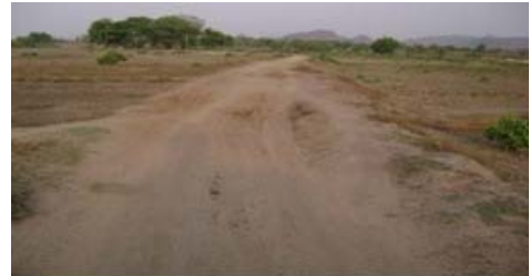
(Improvement of road from Balandapada road in Gochhapada Gram Panchayat)

Joint physical verification of five roads (expenditure: ₹ 13.32 lakh) by Audit in presence of the Junior Engineer and Executive Officers of the concerned Gram Panchayat revealed that these were not fit for all weather connectivity as only earthwork with