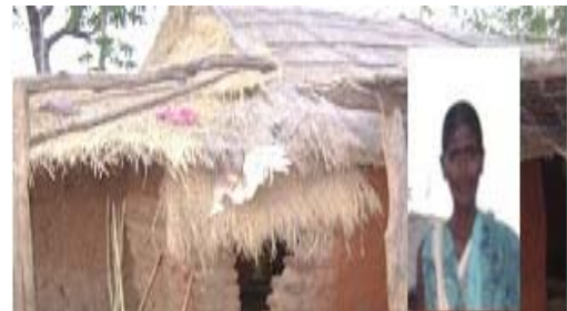
Lata Banka, BPL No- 35 /97, Loinga Village, Harabhanga Block who could not apply for lack of awareness

Check of records of 15 Gram Panchayats revealed that, out of 22636 BPL households (HHs) in the Gram Panchayats (GPs), only 3615 (16 per cent ) applied for the benefit. Due to lack of wide publicity to make people aware of the application procedure, the benefit of the scheme got restricted to a few BPL households.