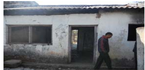
Ghantapada S.C in dilapidated condition

Scrutiny of records revealed that out of 67 SCs functioning in the district, 36 (54 per cent ) SCs were running in private buildings. Despite shortage of own building, only eight new SCs were sanctioned (2007-12) and no steps were taken for construction of more