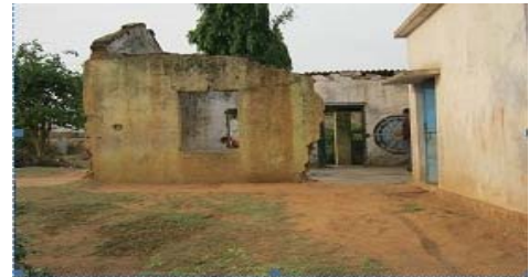
Dilapidated building of AWC Marjadapur

Test check of records revealed that three Block Development Officers (BDOs) received ₹ 61.55 lakh during 2006-10, from the DSWO, Boudh for repair of 193 AWCs exclusively, of which 75 buildings were repaired as of March 2012 and 22 36 buildings were lying unrepaired despite incurring an expenditure of ₹6.25 lakh. Repairing work of remaining 96 projects, though sanctioned during 2006-10 37 were not commenced as on 31 March 2012 even after lapse of one to five years leading to idling of funds of ₹25.35 lakh. Similarly, ₹37.50 lakh were