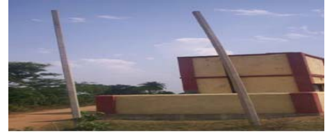
Jamumal PWS under Kantamal Block remained non-functional due to want of power supply

6.4.2 Idling of expenditure on incomplete works. Though the RPWS works were to be completed within one year from the date of their commencement, 37 40 RPWS works were lying incomplete for two to three years. The EE stated (May 2012) that 16 RPWS could not be completed due to non energisation and 21 RPWS remained incomplete due to want of funds.