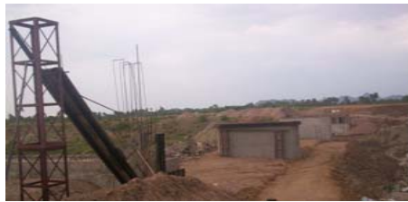
Manmunda Sagada road in Boudh block not in use for missing link

As per guidelines, while making proposal for constructing a road under