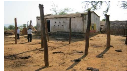
View of Srirampur Primary School, Harabhanga Block functioning in a village community hall surrounded by cowsheds

Joint Physical inspection of 13 schools of the district revealed that 10 (77 per cent) out of 13 schools were running in their own buildings, two schools namely Ainlachuan NPS, Khaliamunda NPS under Kantamal Block had no building of their own and were functioning in school No.3, Khaliapali UGHS. Srirampur Primary School under Harabhanga Block was functioning in a single room of village community hall in