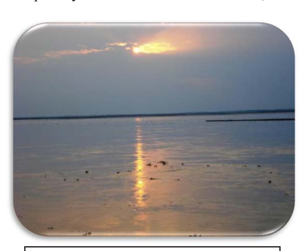
Mighty Brahmputra - principal source of water in Assam

Water resources in Assam as a whole are substantial. About 8,251 sq km representing 10.5 per cent of the total geographical area of the State, is occupied by surface water bodies. Of this, about 6,503 sq km is occupied by