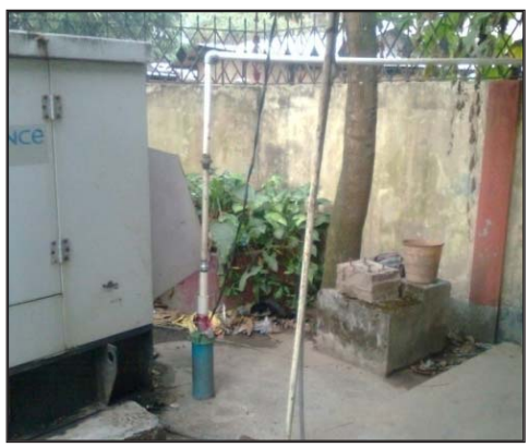
Boring being done and extraction of water from underground sources

It was further observed that despite clear provisions in the aforesaid Act, there is no system of obtaining permission from competent authority before taking up boring for extraction of water in the State. Even the boring service providers are not required to be registered either with the Department or the AUWS&SB. Also, there is no system of monitoring of water drawn from underground sources through deep tube wells. Resultantly, the authorities neither