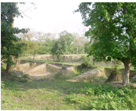
Creation of highland and resultant pits

The earth so removed was dumped at various places away from the shore of the water bodies by using dumpers/tippers. An expenditure of \mathfrak{T} 63 lakh was incurred in the above desiltation process (the remaining \mathfrak{T} 1 lakh was spent on other items for the work). It was also noticed that during the same period, the Division created new highlands/improved existing highlands at five places inside the Sanctuary by extracting 32,972 cum of earth from within the Sanctuary, incurring an expenditure of \mathfrak{T} 39.57 lakh.