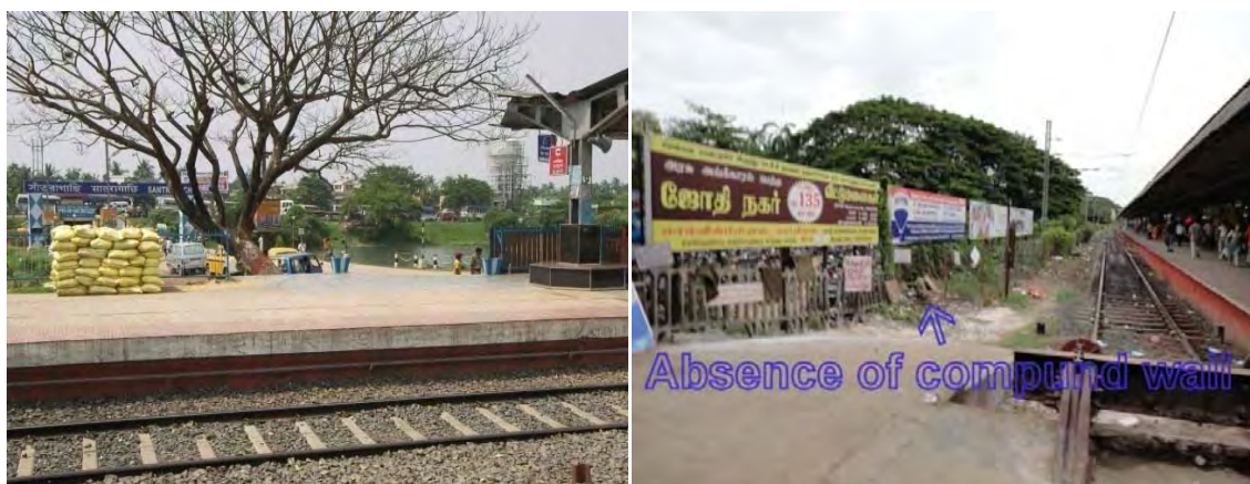
Open area with no boundary wall at Santragachi station in SER

Many of the stations were not secured with either boundary wall or fencing, which gives easy access to miscreants and other unauthorised persons to enter the platform unchecked. Alarmed by the increase in number of track crossings and encroachment cases, Railway Board in September 2008 instructed all Zonal Railways to construct boundary walls along the tracks. Initially the work of construction of boundary wall was included in the Integrated Security System. However, this item was later deleted from the scheme and funds required were to be assessed separately. General Managers were advised by the Railway Board to ensure construction of boundary walls based on threat perception and vulnerability, as assessed by the Zonal Railways.