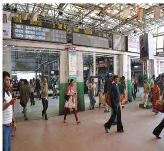
Unrestricted entry-Sealdah Station , ER

In ECoR, NCR and SCR of the four stations each checked, only three out of the 38 unauthorised entry points were guarded. In WCR, at the four stations test checked there were 19 unauthorised entry points, of which only three were guarded.