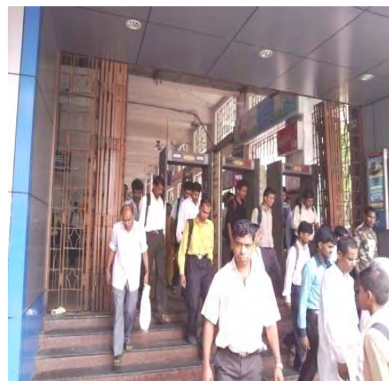
Gaps near DFMD at Church Gate (WR)