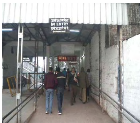
Unrestricted entry-Hazrat Nizamuddin, NR