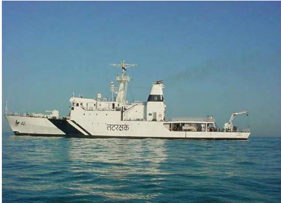
An Offshore Patrol Vessel at sea