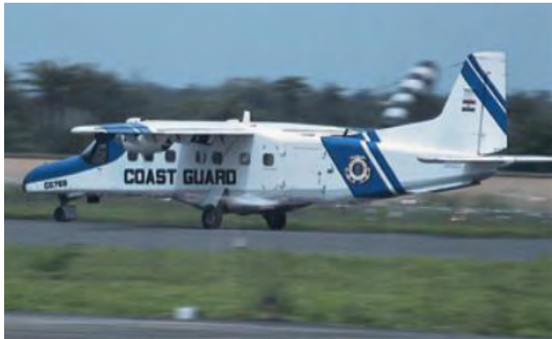
ICG Dornier Aircraft

ICG has government sanction to operate four squadrons of Dornier, four squadrons of Chetak and one squadron of ALH. As high as 82 per cent of the Chetaks and 54 per cent of the Dorniers of Indian Coast Guard are more than 15 years old. This age profile compares unfavourably with the prescribed life of Chetak helicopters of 15 years and that of Dornier Aircraft at 20 - 25 years. Two squadrons of Dornier and all four squadrons of Chetak are operating fewer number of aircraft than the sanctioned Unit Establishment (Annexe 2), as ICG is operating five aviation units with re-appropriation of assets. Operational availability of Chetaks and Dorniers on an average was 84 and 78 per cent respectively during the audit period.