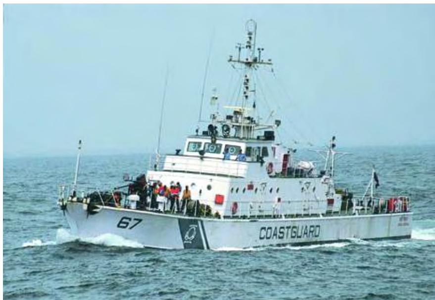
Inshore Patrol Vessel at Sea

The Indian Coast Guard's operational capabilities are reflected in a wide range of ships, aircraft and associated equipment which are required for the Coast Guard to perform its tasks and respond successfully to unforeseen and emergent situations. Force levels are important, both in terms of numbers as well as technology, since the Coast Guard is responsible for 2.01 million sq km of sea area over which India claims exclusive rights for exploration and exploitation of resources, both living and non-living.