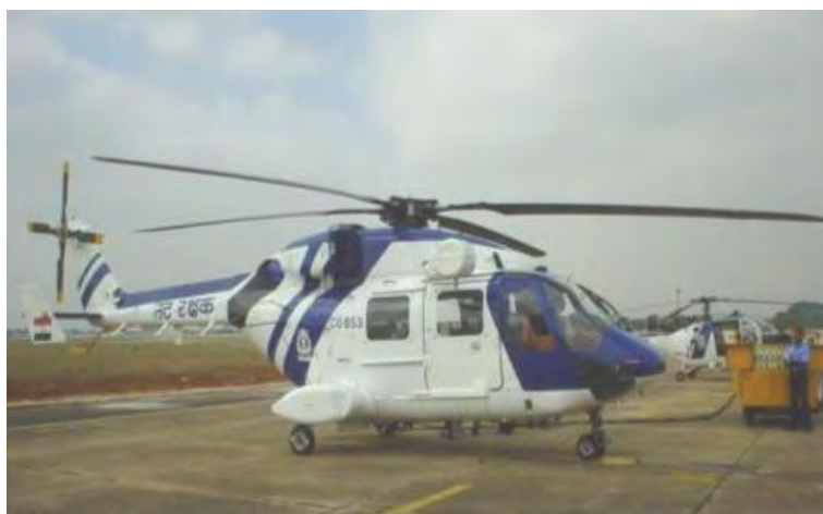
ICG Advanced Light Helicopter

In order to meet its requirements primarily for search and rescue role and afloat operation, Coast Guard Development Plan 1992-97 provided for acquisition of two twin engine helicopters for which the ICG identified the Advanced Light Helicopter (ALH). However, first ALH was delivered in March 2002 and second ALH was received in March 2003.