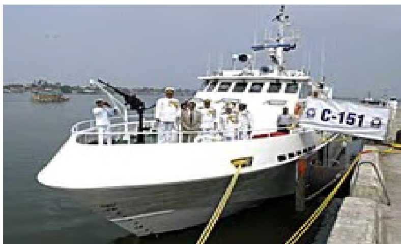
ICG Intercepter Boat

Audit noticed that the time actually taken for SR, NR and MR of AOPV/OPVs during 2003 - 2010 was 86 per cent, 113 per cent and 127 per cent respectively more than the bench marked time lines prescribed by ICG in May 1993. Similarly, the time actually taken for SR, NR and MR of IPV/FPVs during 2003-2010 was 314 per cent, 175 per cent and 53 per cent respectively more than the bench marked time lines for this class of ships. The actual time taken in MR of AOPV/OPV and MR of IPV/FPV has exceeded even the liberal time schedule prescribed in the contracts. Audit noted that in the case of 31 refits undertaken for AOPV/OPV between 2003 and 2010, the time taken was 27 per cent more than the contract while the corresponding figure in the case of 74 refits taken up for FPV/IPV/SDB, was 51 per cent more.