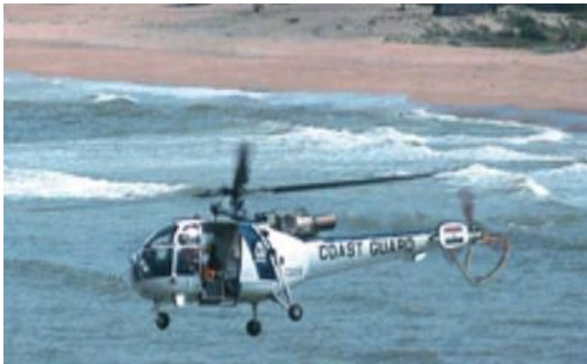
ICG Chetak in flight

The repair/maintenance of ICG aircrafts is carried out on a fixed schedule, i.e. after completion of certain period/flying hours. The duration of inspections are also prescribed.