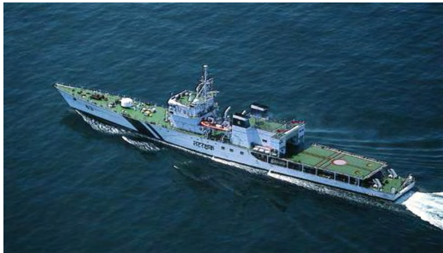
ICGS Advanced Offshore Patrol Vessel

The operational-cum-refit cycle, promulgated in 1993 for the AOPV/OPV and FPV/IPV/SDB class of vessels, implies that ships have to be operationally available for a certain number of days, out of which the ships have to be deployed at sea for roughly 50 per cent of the time. In the remaining period, ship should be operationally available in harbour for deployment as required. As per norms of 1993, the AOPV's have to be operationally available for 160-170 days per year with the required sea days being 80-85 per year. In 2004, the ICG issued directives raising the number of days required at sea to 120-144 per year for all classes of ships.