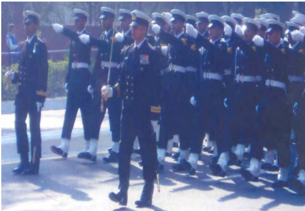
Coast Guard personnel marching

Manpower is fundamental to the development and sustenance of the service. Staffing requirements are required to keep pace with the acquisition of ships and aircrafts.