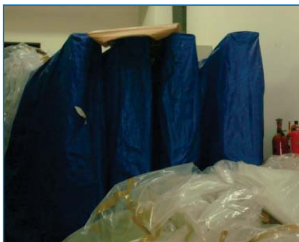
Non-use of trampoline during CWG 2010