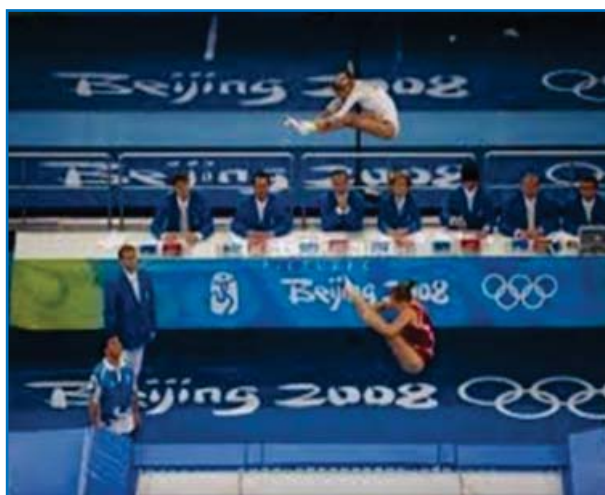
Use of trampoline during Beijing Olympic 2008