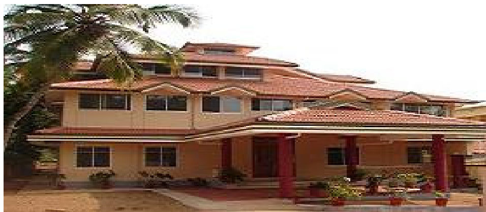
Ladies hostel, NIT Calicut (Kerala)

As per section 38 (1) of the Statute, every Institute shall be a residential institution and all the students and research scholars should be provided accommodation in the hostels and halls of residence built by the Institute for the purpose.