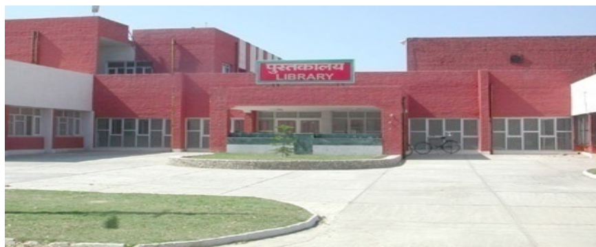
Library, NIT Kurukshetra (Haryana)

It was appreciating to note that all the NITs under review were having library as on 31 March 2010. However, the shortage of computers as compared to the norms of one computer per four students ranged between two and 569 in six NITs 14 as on 31 March 2010. However, computers were in excess over the norms at NIT, Allahabad (52), Bhopal (166), Calicut (307), Hamirpur (394), Jalandhar (465), Nagpur (235), Raipur (701) Rourkela (253), Silchar (223), Surathkal (885) and Tiruchirappalli (271) as detailed in Annexe-VIII . Computers should be provided in each NIT as per norms.