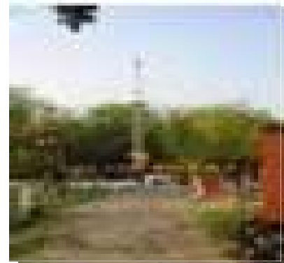
Gate ACD MLCG

All the ACDs interact with each other and exchange information when they are within their radio zones up to three kilometers. While approaching a station, loco ACD gives station approach warning to the driver. In the event of not acknowledging this warning, the speed of the train is regulated automatically. While entering the station area, if loco ACD detects a train on the main line the system automatically regulates the speed. In the mid section, loco ACDs remain in look out position to detect the presence of other trains in a radius of three kilometers. In case, another train is approaching on the same track, the ACDs apply brakes in both the trains to bring them to a stop thereby reducing possibility of head-on collisions. When a train is approaching a level crossing gate, visual and audio warning is initiated by the ACD systems for the road users.