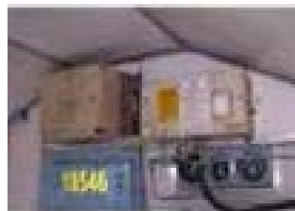
LOCO ACD ABU