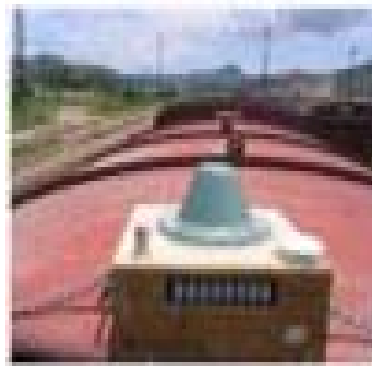
Goods Guard ACD