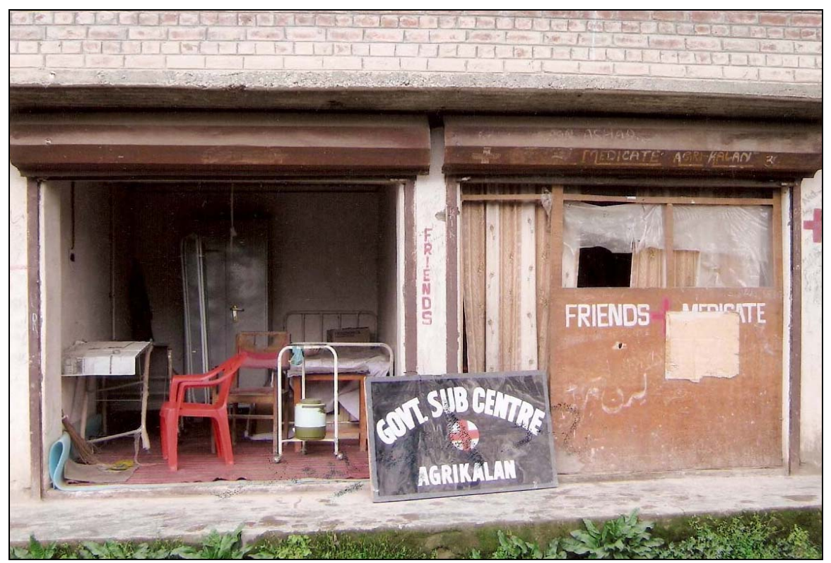
Sub-centre Agrikalan (Pattan) housed in shops