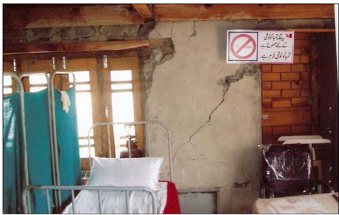
Sub Centre Pheli Pora full of cracks