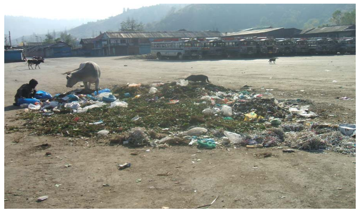
Waste in middle of town