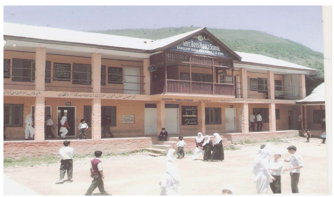
1) M/S Benglobagh. 2) P/S Azad Ganj. 3) P/S Syed Karim Housed in single building

Housing of a number of schools in one single building was bound to effect providing quality education to children due to interference of the activities undertaken by one school with the others.