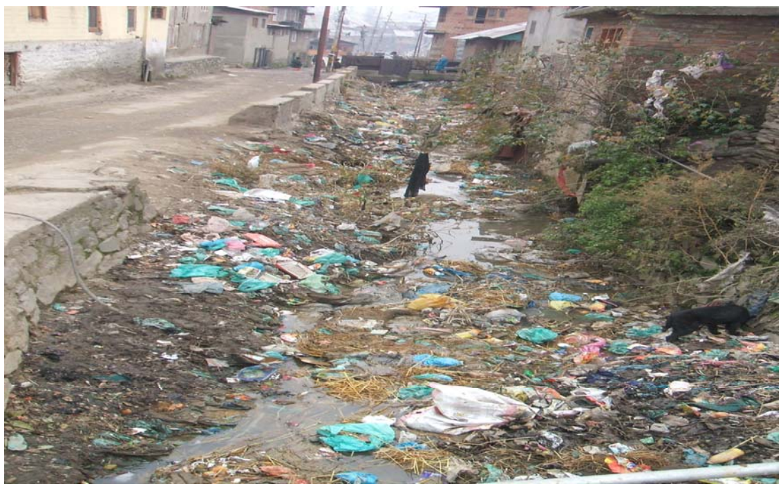
View of Municipal waste at Baramulla Town

exposed to open environment. The Council was not equipped with such facilities and waste was being transported in uncovered vehicles.