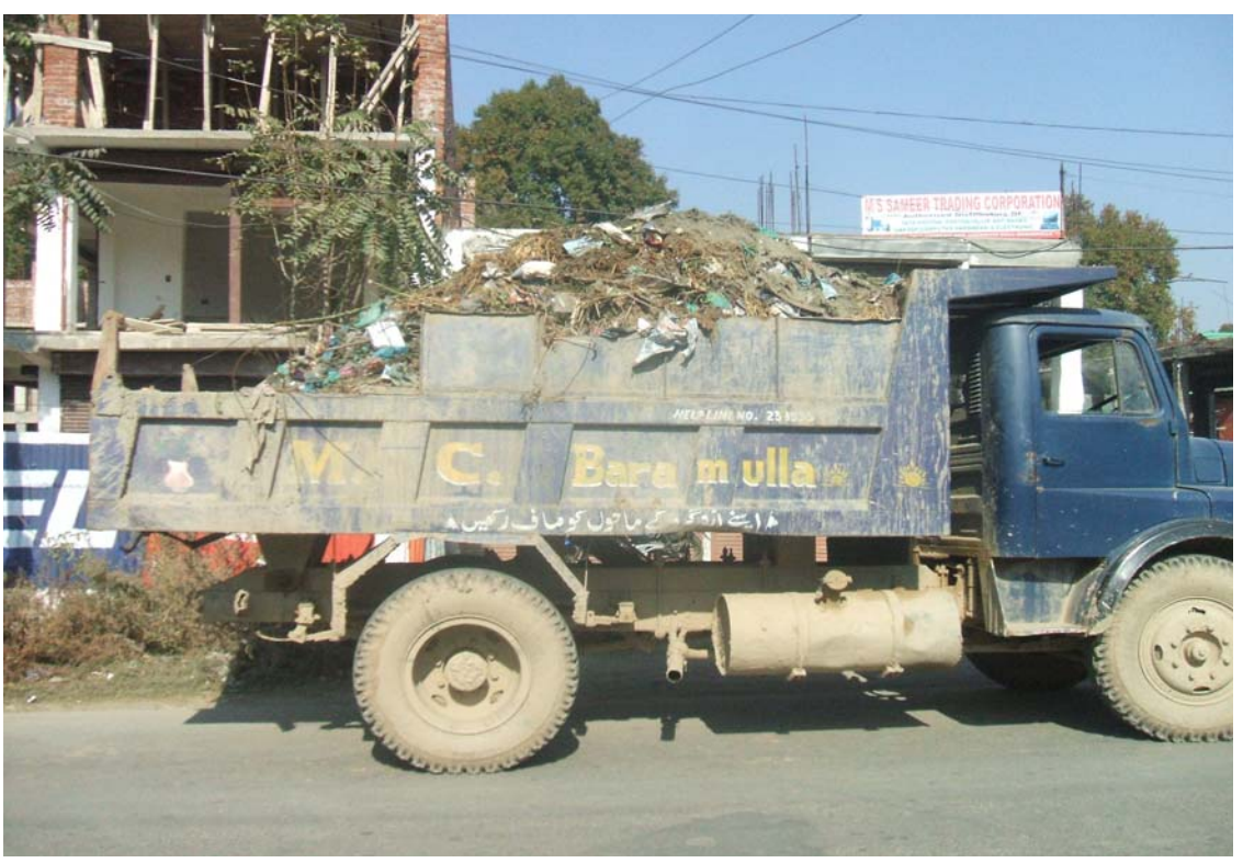
Waste loading vehicle without cover in Baramulla Town