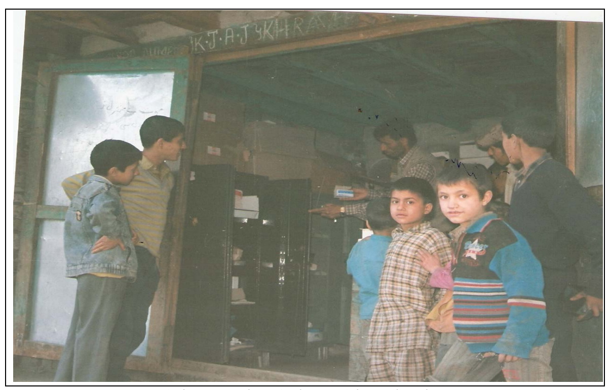
Sub-centre Dhani Suden (Uri) housed in shop