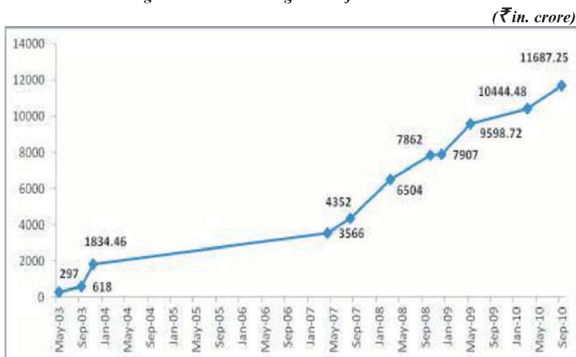
Figure 2.2 – Increasing trend of cost estimates

There were seven upward revisions in budget estimates from April 2007 to September 2010 at very short intervals, representing a three-fold increase (from ₹ 3566 crore to ₹ 11,687.25 crore). This was the outcome of a piecemeal approach adopted in planning in the initial stages.