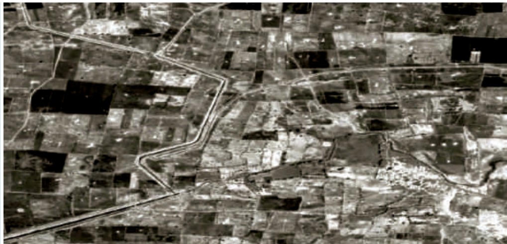
Remote sensing satellite data

Audit Objective 4: To assess whether the remote sensing application projects were helping in the efficient management of national resources in the fields of agriculture, water resources, urban development and disaster management.