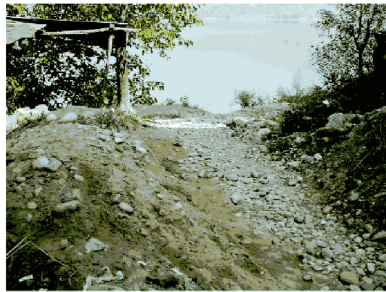
Jetty at Jeoripattan not constructed