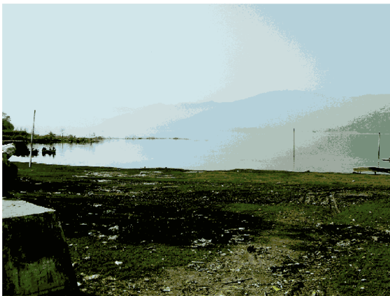
Jetty at Luhnu not constructed