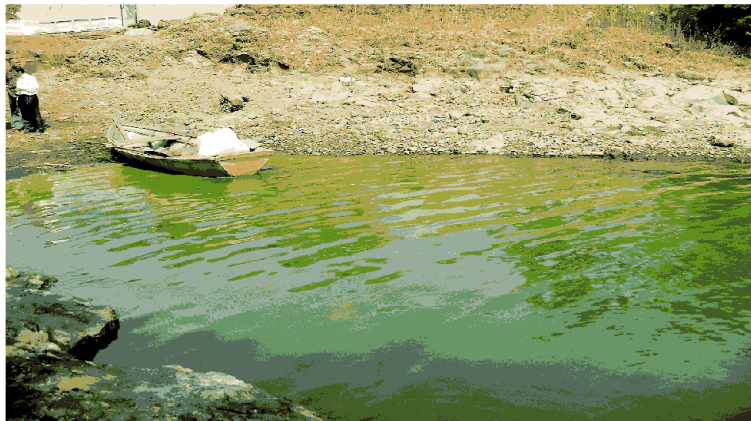
Jetty at Papri Kalan submerged in water

One jetty at Papri Kalan, which had a sanctioned cost of Rs. 6.00 lakh but was awarded at Rs. 7.59 lakh, had been constructed in 2006-07 was found completely submerged in water during the audit team's field visit in November 2008. This indicated lack of proper planning, study and survey before selection of the site and deciding the level and design of the jetty.