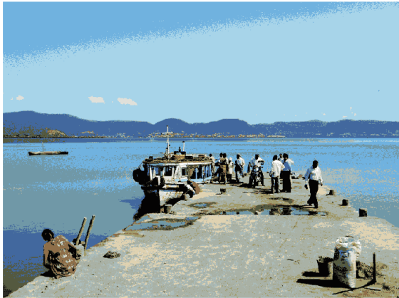
Existing jetty at Agardanda