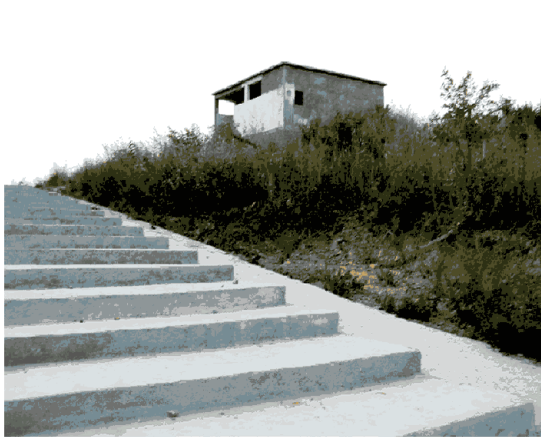
Waiting Hall at New Sapta not yet operational

Field visit by audit revealed that the planned Jetty, Booking Office and Waiting Hall at New Sapta had been constructed. However, IWT had not been operationalised, as the agency responsible for regulation of the transportation system had not been decided in the absence of guidelines from the Central and State Government. The expenditure of Rs. 3.67 crore (including Central share of Rs. 0.83 crore released in March 2006) incurred on the project and the facilities created remained unproductive as of November 2008.