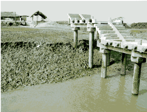
Jetty at Hogalduri without approach road