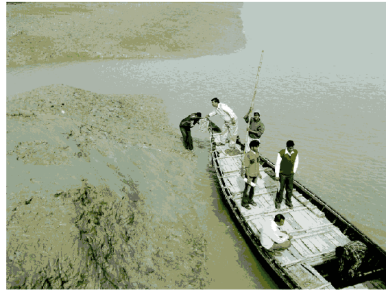
Commuters at Hogalduri not using the newly constructed jetty