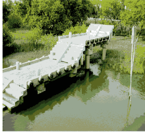
Jetty at Satjelia without approach road

While Audit was informed (January 2009) that 10 out of 18 jetties had been completed, field audit revealed that the approach roads and protective work were yet to be constructed, rendering the jetties effectively unusable. According to the State Government, construction of approach roads could not be taken up due to non-availability of Central funds.