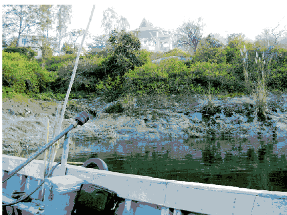
Terminal approach at Challelaghat not constructed