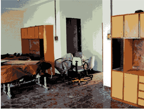
Office for MMB in Mandwa Terminus Building constructed out of IWT funds

supply pipeline. As against this, MMB incurred an expenditure of Rs. 1.32 crore which included construction of unusually high class amenities (first class and VIP waiting area after booking, open to sky sit out, restaurant with kitchen and service to kitchen road in place of cafeteria). Further, an office for MMB was also constructed, which is outside the scope of IWT scheme.