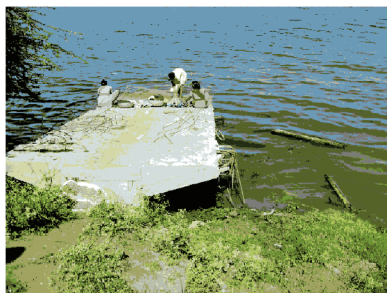
Lack of approach road for jetty at Mohanpur