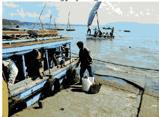
Existing jetty at Rajpuri