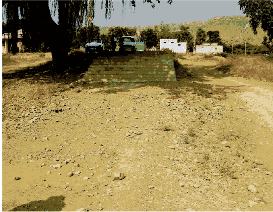
Rampura Jetty far way from water

The jetty constructed at Rampura, which had a sanctioned cost of Rs. 0.21 crore, was not serving any purpose, as there was no water within a range of two kilometres from the jetty. The waiting hall and booking office constructed