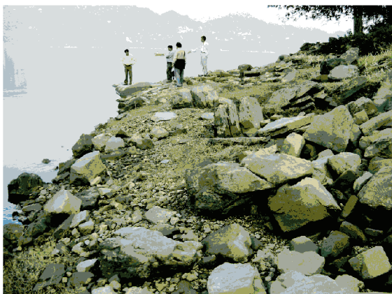
Small jetty at Nakranaghat not constructed