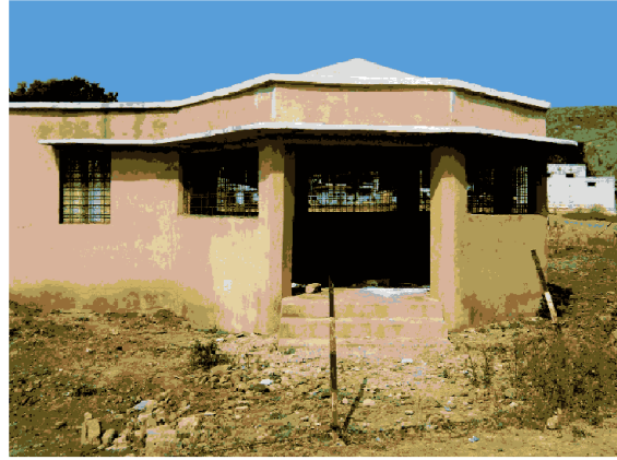
Deserted Waiting Hall and Booking Office at Rampura

in March 2008, were also deserted, as the actual boarding point was far away. Audit further observed (November 2008) that commuters were using a temporary shed of dried leaves as the waiting hall. There was no maintenance of the assets created at Rampura – notably the approach road, the booking office and the waiting hall.