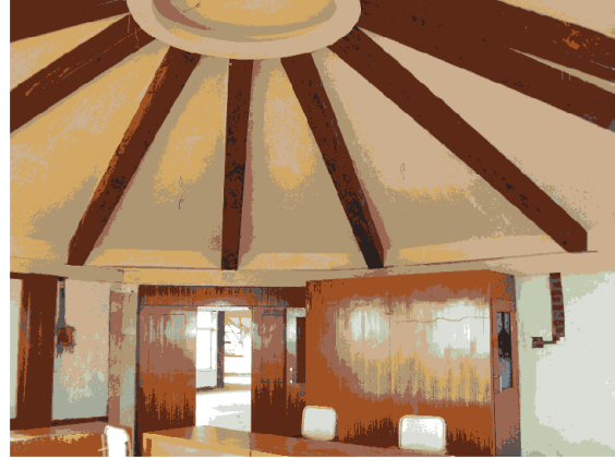
First Class and VIP Waiting Hall at Mandwa

Thus funds provided were used primarily for creation of amenities way beyond the requirement of the normal IWT passengers. Further, unusually high consultancy charges of Rs. 32.00 lakh, even more than the MoS sanction of Rs. 27.00 lakh for passenger amenities, were incurred for consultancy charges. On the other hand, navigational components like dredging, break water, hydrographic survey, studies and investigations were not carried out. Thus as against the sanctioned amount of Rs. 0.27 crore for creation of passenger amenities and external water supply pipeline, Rs. 1.64 crore (including consultancy charges) had been reportedly incurred as of December 2008. The balance amount of Rs. 1.77 crore needed to be refunded to GoI.