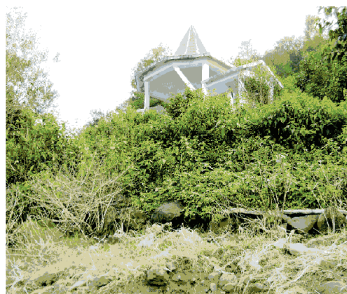
Approach to Passenger Shed at Nakranaghat not constructed