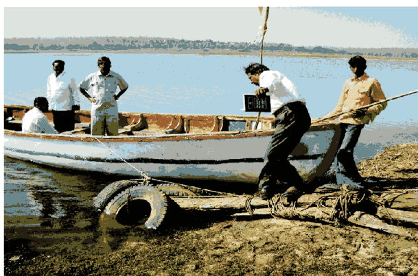
Boats operational at Warkhed without a jetty

An amount of Rs. 78.00 lakh had been released as Central share in March 2006. However, Government of Maharashtra released Rs. 3.90 crore to the nodal agency, MMB, between January and March 2008, which was lying unutilized as of November 2008, although the executing agency 1 was ready to carry out the execution of the work. Field audit revealed that, in contrast to the situation at Vishnupuri, boats and ferries were operational, but no jetties or waiting halls had been constructed.