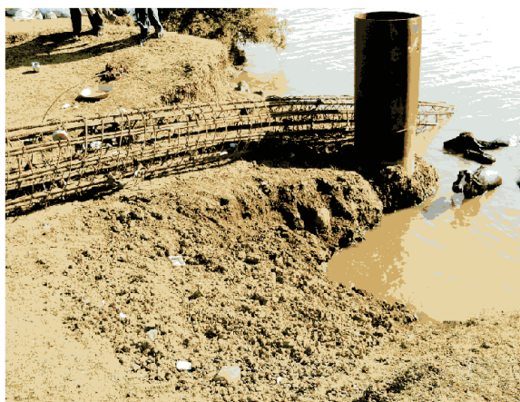
Proposed Jetty at Rahati – work started and stated to be nearing completion, but evidently not in progress