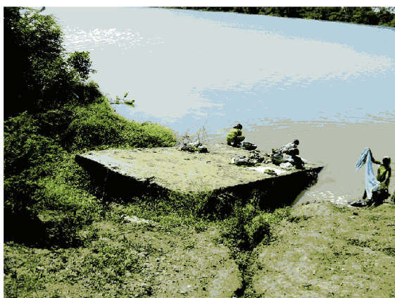
Jetty at Gangabet not in operation