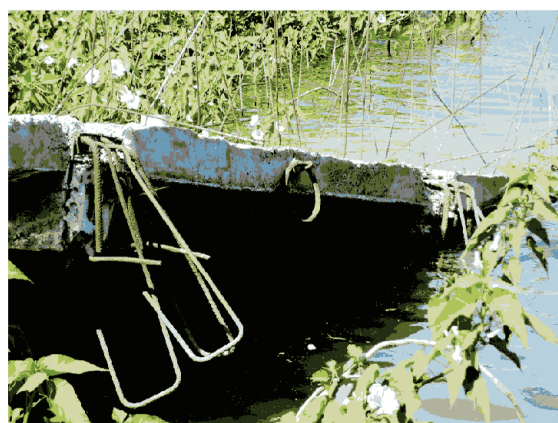
Jetty at Markand stated to be completed, but needing finishing, railing and steps