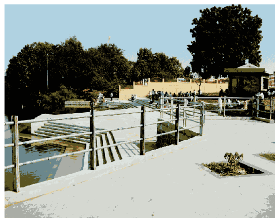
Complex of bathing ghats at Kaleshwar – diversion of IWT scheme funds