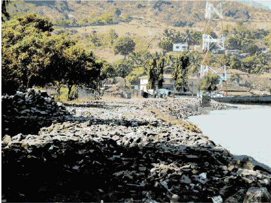
New approach road at Dighi – still in progress