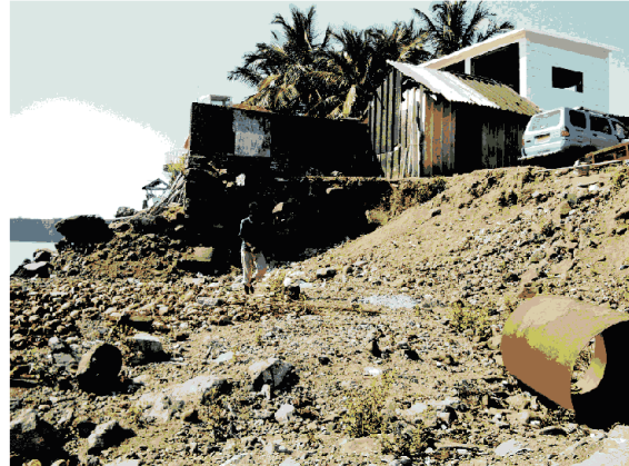
Existing Waiting Shed at Rajpuri dismantled