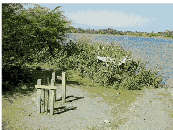
No approach road for jetty at Markand