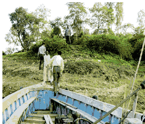
Small jetty at Challelaghat not constructed