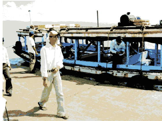
Existing jetty at Dighi