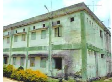
Hostel Building constructed for Government Women's college, Sundargarh lying idle

The Government of India (GoI) provided ₹ 50 lakh during 2000-01 to the Project Administrator (PA), Integrated Tribal Development Agency (ITDA), Sundargarh for construction of a 100 seated hostel building for the Scheduled Caste/Scheduled Tribe (SC/ST) girl students in the Government Women's College, Sundargarh. ITDA, after its completion (March 2005), handed over the hostel building to the Principal, Government Women's College, Sundargarh in July 2005.