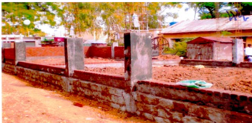
Incomplete work of Government Girl's High School, Molkalmuru

The CEO, ZP, Chitradurga administratively approved (January 2008) the work of construction of five class rooms in Government Girls' High School, Molkalmuru at an estimated cost of ₹23 lakh. The work was entrusted (February 2008) to Nirmithi Kendra (agency) for which an amount of ₹20 lakh was released (March 2008). The site for construction of school was already identified and made available by the Town Municipality, Molkalmuru to the Department during 1985 itself.