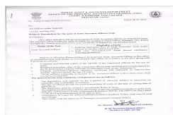
01.jpg 885 KB

CAG-ALL-OFFICES mailing list -- cag-all-offices@lsmgr.nic.in To unsubscribe send an email to cag-all-offices-leave@lsmgr.nic.in