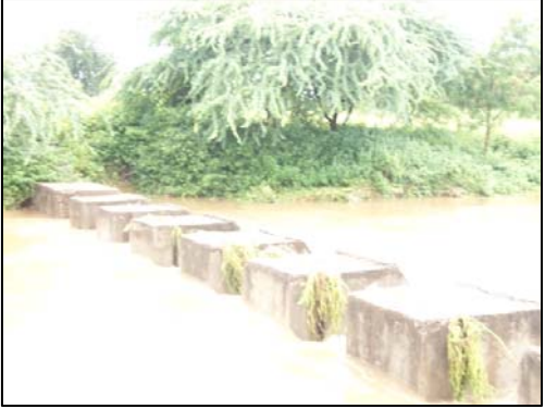
The erosion position of the Oon Stop dam without bank potation

Thus, construction of stop dam without proper designing resulted in the bank of the stop dam being damaged.