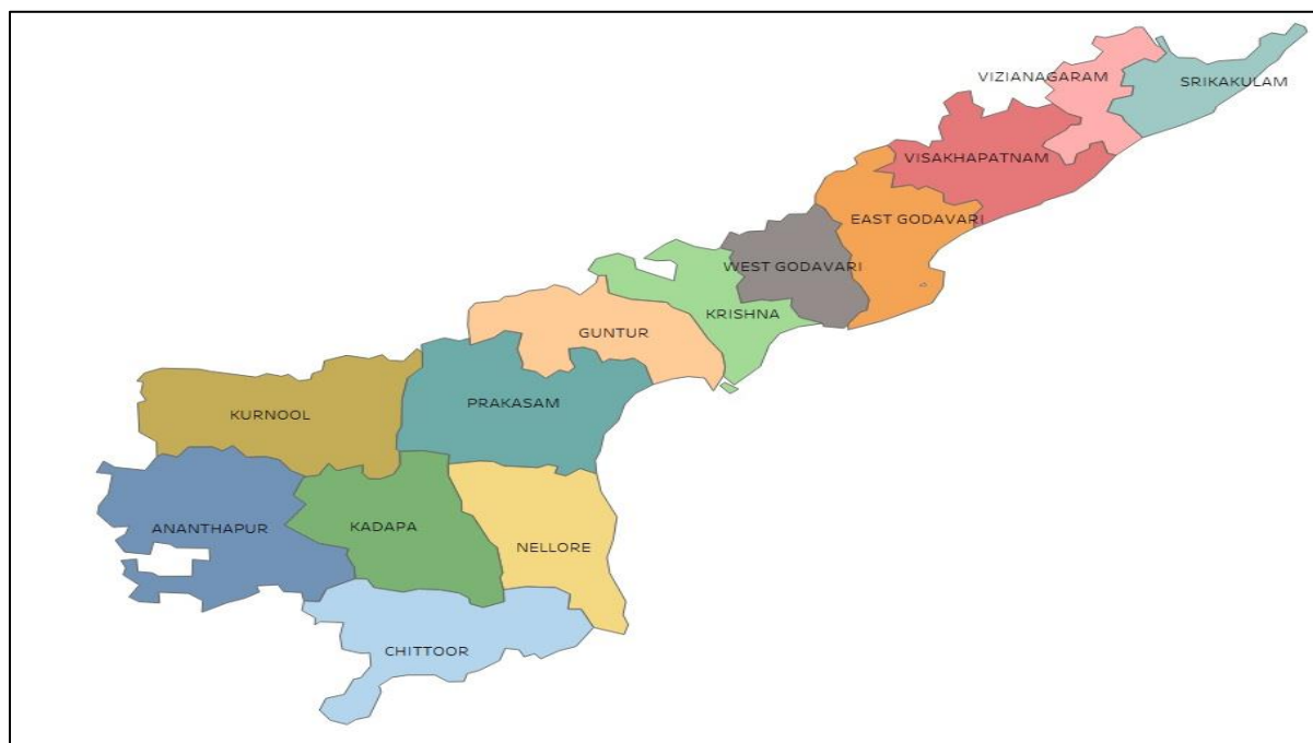
Figure 1 Districts of Andhra Pradesh

The Treasuries and Accounts Department carved out of the Revenue Department on 1.4.1958, with the mandate of upholding financial propriety in State Public financial operations. The Department has two wings—Treasuries and Accounts. While the Treasuries operate at the district and below district levels, through District and Sub Treasuries located at the erstwhile Taluk level, Accounts Branches assist at the Heads of Departments level, in the capital region. Presently, there are 13 District Treasuries, AP State Capital Region Treasury, 196 Divisional Sub Treasuries and Sub Treasuries functioning in the field, whereas nearly 24 Accounts branches of 183 HODs are operating at the Headquarters.