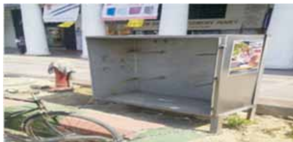
Empty and damaged Fire Hydrant Box