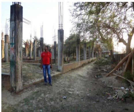
Four storey RCC building of General Nursing Midwifery (GNM) School-cum-Hostel at Nagaon (30.06.2016)

Scrutiny revealed that three works 40 for enhancing infrastructural facilities at tendered value of ₹ 6.33 crore due for completion between December 2009 and June 2012 had been abandoned after incurring an expenditure of ₹ 4.01 crore and physical progress of 40 to 76 per cent due to problems with the contractor and poor site selection.