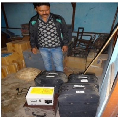
Maxer brand Laparoscopic machine lying idle in Lakhimpur (30.06.2016)

It was seen in audit that the doctors from concerned health centres reported difficulties in using the machine due to which the machines were lying idle. The expert committee formed in this regard opined (January 2014) that the Karl Storz brand Laparoscopic Machines were more comfortable to operate. Subsequently, during 2013-14, 11 Single Puncture Laparoscopic sets of Karl Storz brand were procured and provided to 11 DHs.